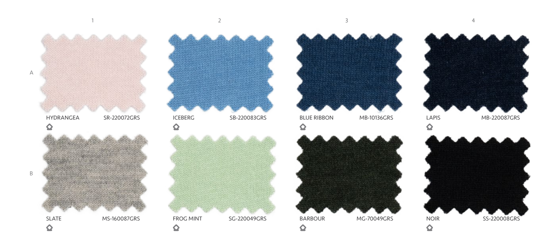
Dash - COMH