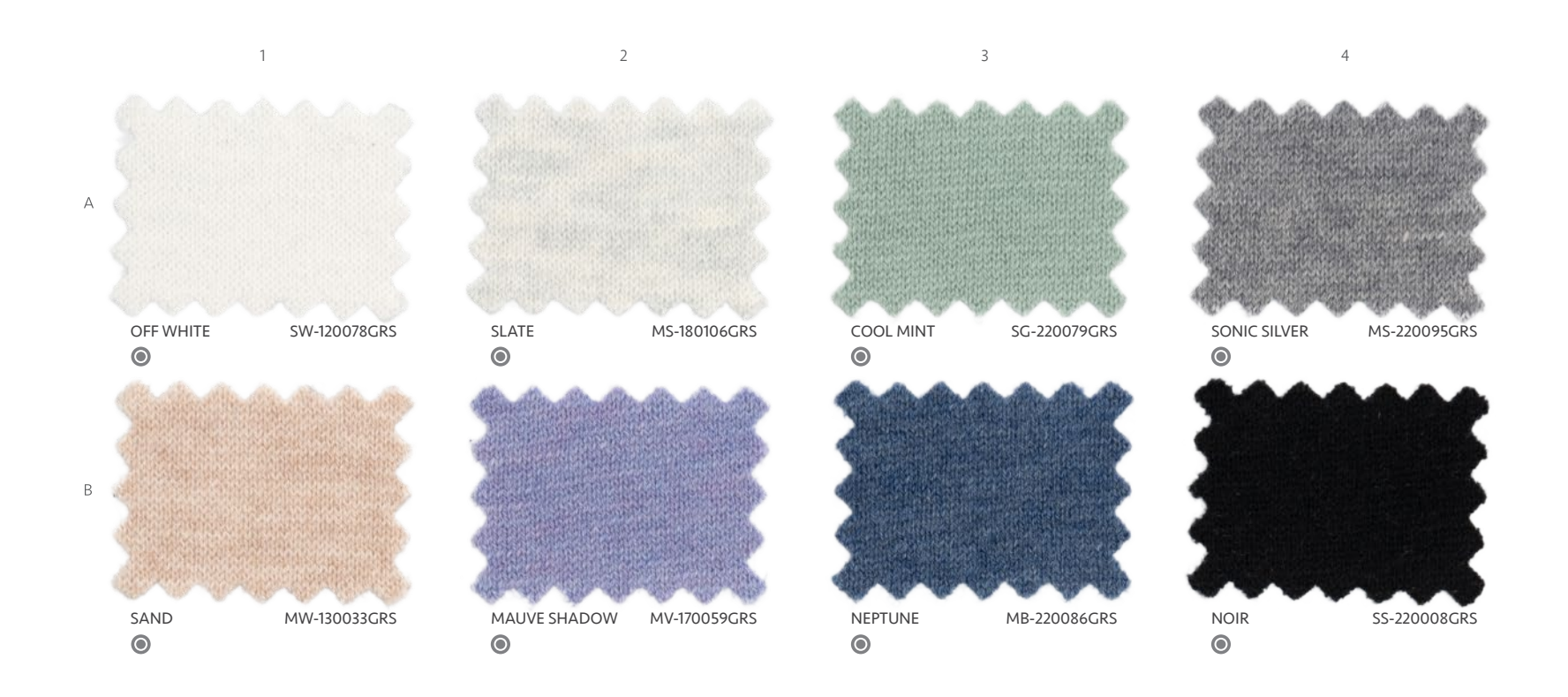
Perusal - RYH