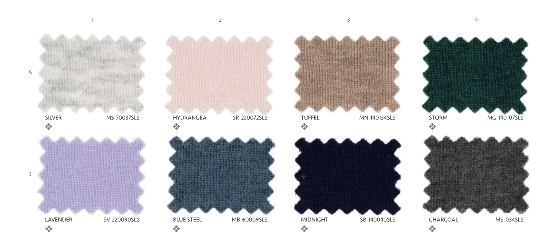
Panorama - RFDH