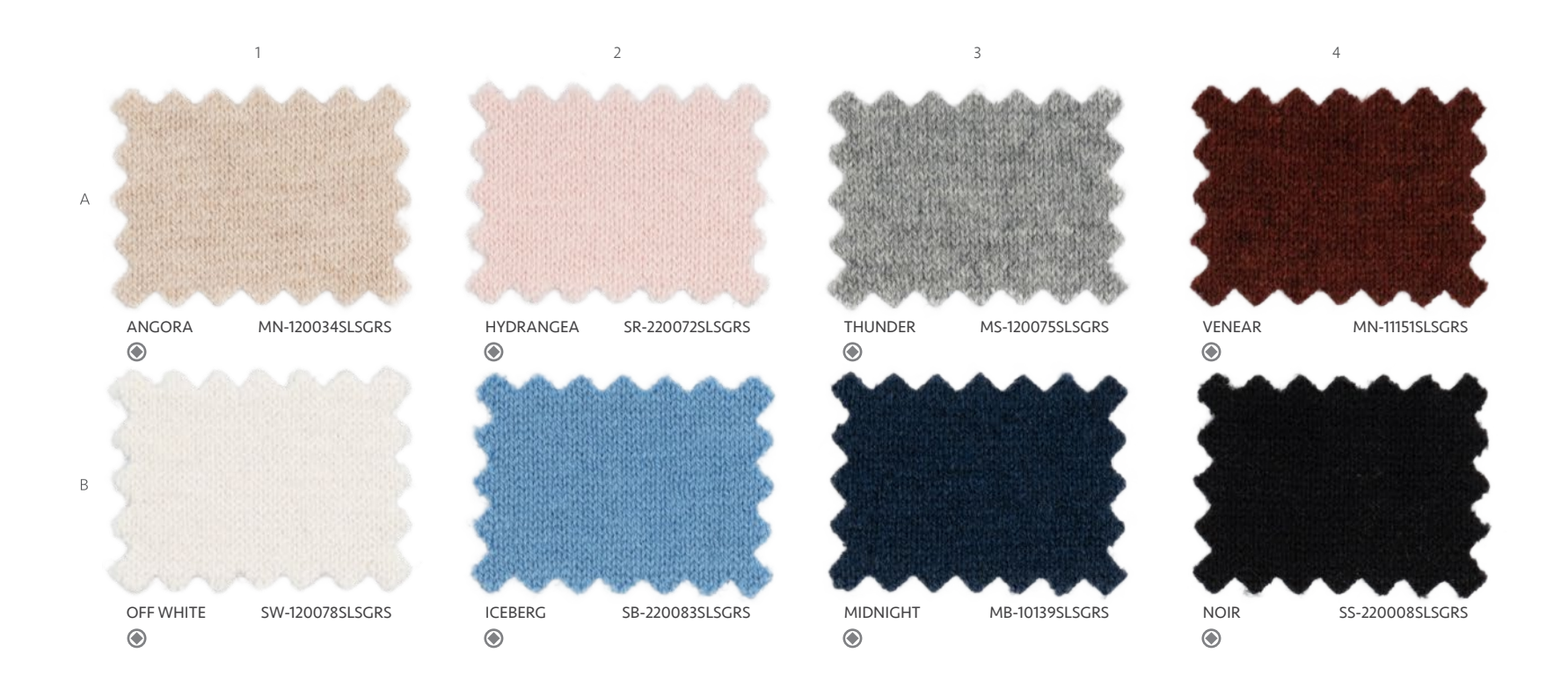
Shield - TOH